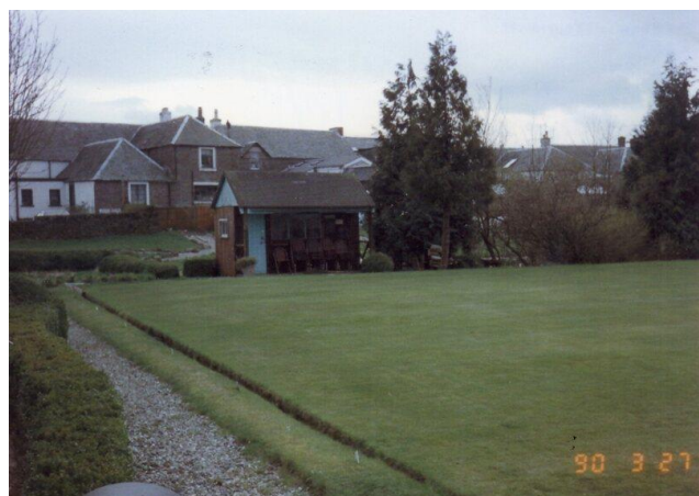
Lost bowling greens of the Dunblane area (2) – Thornhill Bowling Green 1990